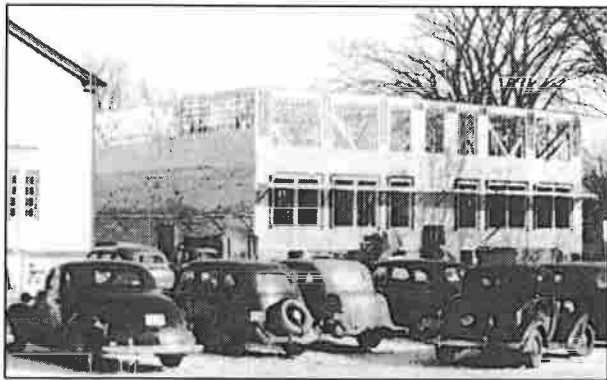
Construction of Beeman after 1940 fire