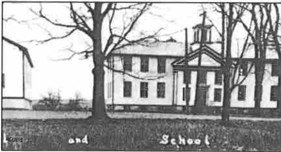
Beeman Academy, built 1870