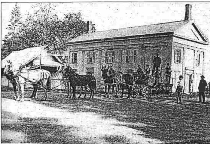
Road crew pose with scraper in front of the Town Hall, ca.1910.

October's What? Where? When? was a picture of the old Town Hall, which stood on the southwest corner of Route 17 and Town Hill Road (site of the town's war memorial & flagpole). It was built in 1856 and burned down because of an overheated stove pipe eighty years later, on January 5, 1937. Several people who now live in town watched the fire when they were children. This is a picture of it, from the 1984 history, New Haven in Vermont .